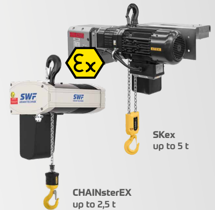
CHAINsterEX up to 2,5 t

Both models are reliable and built to last. They can be used flexibly. CHAINsterEX balances many different requirements in the EX area with ease. With SKex, implementing EX-proof crane systems with very specific requirements is no problem.