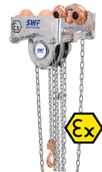
CRAFTsterEX up to 20 t

CRAFTsterEX is independent of the power supply, offers a robust construction in combination with a high-quality interior and makes ideal use of space. The compact designed hand chain block is easy to transport to the site of operation and easy to operate.