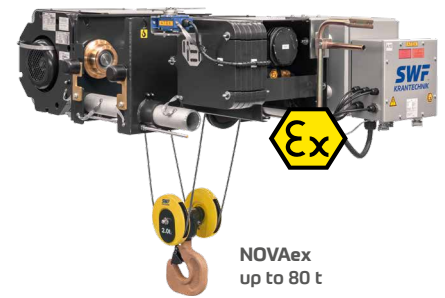
NOVAex up to 80 t

NOVAex features a compact design, minimal hook dimensions and the best approach dimensions available on the market. Its extra-large diameter of the rope drum is gentle on the load-bearing rope. Plus, the breaks and the lubrication of the hoist gear are designed to last a lifetime. NOVAex has extremely low maintenance requirements and is reliable.