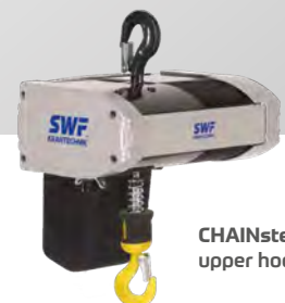
CHAINster with upper hook

The integrated CHAINsterGT frequency inverter allows a broad speed range and therefore effective, fast yet precise load handling.