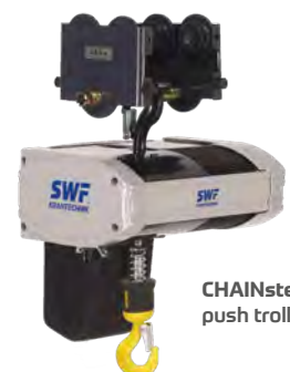
CHAINster with push trolley