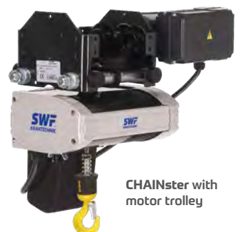
CHAINster with motor trolley